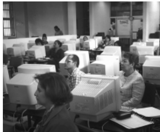
A recent workshop in Honduras