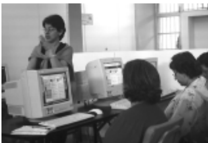
Facilitator at recent Honduras workshop

The conference was attended by 92 participants from different information units and geographic areas of the country, among which were representatives of university libraries, the national library, school libraries, specialised information centres and international organisations.