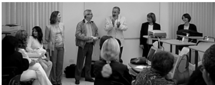
CLACSO training session