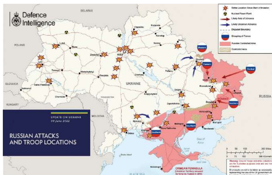
Figura 2. Conquiste territoriali della Russia (9 giugno 2022)

Dalla primavera del 2021, la Russia ha stanziato numerose truppe alle frontiere con l'Ucraina, dopo la richiesta di Zelensky di entrare nella Nato. Il 24 febbraio del 2022, l'esercito della Russia ha invaso l'Ucraina, attaccando Kiev, e le zone di confine (con combattimenti in città come Kharkiv e Mariupol) con la Russia: non solo in Donbass. La Russia ha lanciato attacchi anche verso Odessa, ma sinora sono falliti. È iniziata una guerra tra i due paesi. Zelensky ha chiesto anche l'adesione all'Unione Europea. Nel mese di marzo il governo di Kiev ha accettato l'idea che l'Ucraina possa diventare neutrale, ma ha negato la possibilità di fare concessioni territoriali (Donbass e Crimea) alla Russia. I governi occidentali (gli Stati Uniti e quelli dell'Unione Europea) hanno attuato sanzioni economiche contro la Russia e hanno venduto armi a Zelensky. Nel giugno del 2022 i morti erano arrivati a circa 50 mila, e i rifugiati a 3 milioni e mezzo.