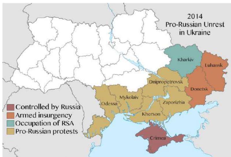
Figura 1. Regioni separatiste nell'Ucraina dell'est (2014)

La guerra in Ucraina dal 2014 al 2021 ha provocato circa 10000 morti, che erano poi calati a circa un centinaio l'anno. Nel 2021, il Donbass ha ricevuto una pagella di 4 su 100 dalla Freedom House.